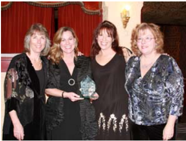
The Festival at Sandpoint was honored as Business of the Month at the 2008 Chamber Choice Awards.

The cost is $15 for individuals and $25 for couples. To register for the event, visit SandpointChamber.com or contact the Chamber offices at 263-2161.